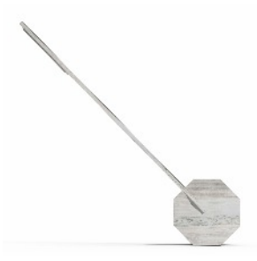
Product Code: GK11A12