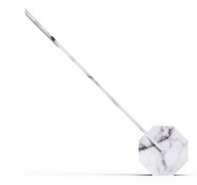
Product Code: GK11W5 White Marble