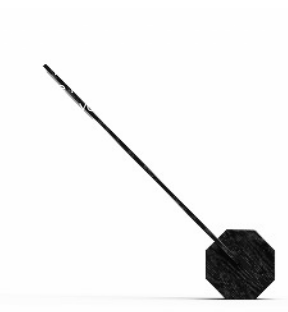
Product Code: GK11B10 Black